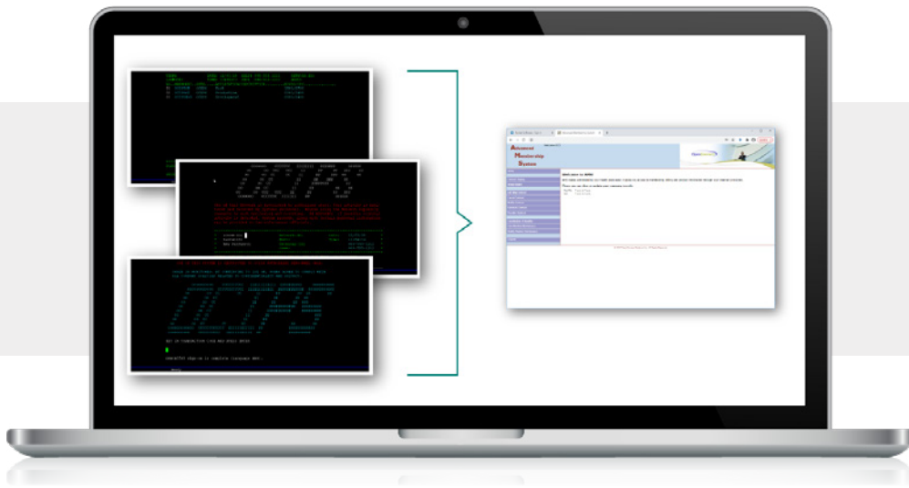
Figure 3: Combine multiple screens into a single page